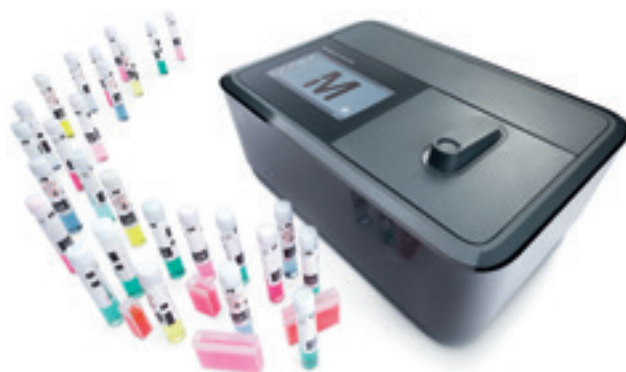
Figure 1. Spectroquant® Prove 600 photometer

The advantage of this test is that it is quick and easy to use without major instrument investment needed. All necessary reagents are supplied in the test kit in a ready-to-use format. Compared with classic photometry, the use of the corresponding Spectroquant® photometers enables the time-consuming calibration procedure to be dispensed with, since the method is already pre-programmed into the devices. Using the 100-mm cell, the Prove 600 spectrophotometer is capable of measuring silicate concentrations as low as 0.25 µg/L SiO 2 , thus ensuring the detection of extremely low amounts of dissolved silicate. The overall measuring range of the test kit is 0.25–500.0 µg/L SiO 2 .